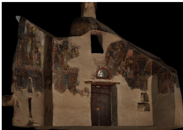
Fig.5. 3D view from the inside of the 3D textured model of the Naos