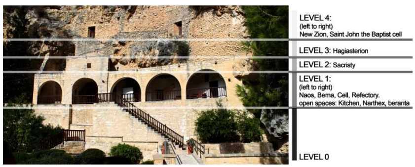
Fig. 4. Facade of the old monastery complex with all five levels (photo: David Castrillo, 2016)