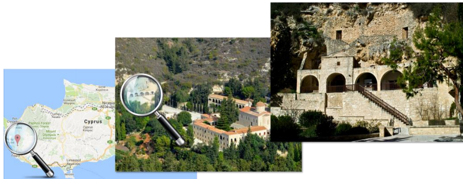
Fig. 1. Geolocation of the Saint Neophytos' Enkleistriotis monastery complex in Cyprus, north of Paphos (left); the New Monastery (centre); the Old Monastery (right)

five years remained at the St. Chrysostom monastery near Kyrenia, cultivating the land and learning how to read and write. After two years he set off for Jerusalem and shortly afterwards attempted to go to Asia Minor in search of solitary life and enlightenment. His attempt was unsuccessful and therefore decided to become an ascetic at the hilly area above Paphos. In 1159 A.D. he departed for his place of reclusion and formed his cell by modifying an already existing one, encurved on the body of the mountain.